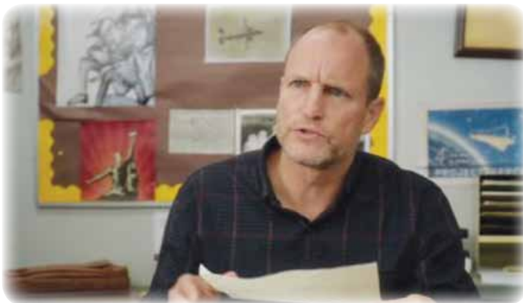
Woody Harrelson is the Sardonic Mr. Bruner