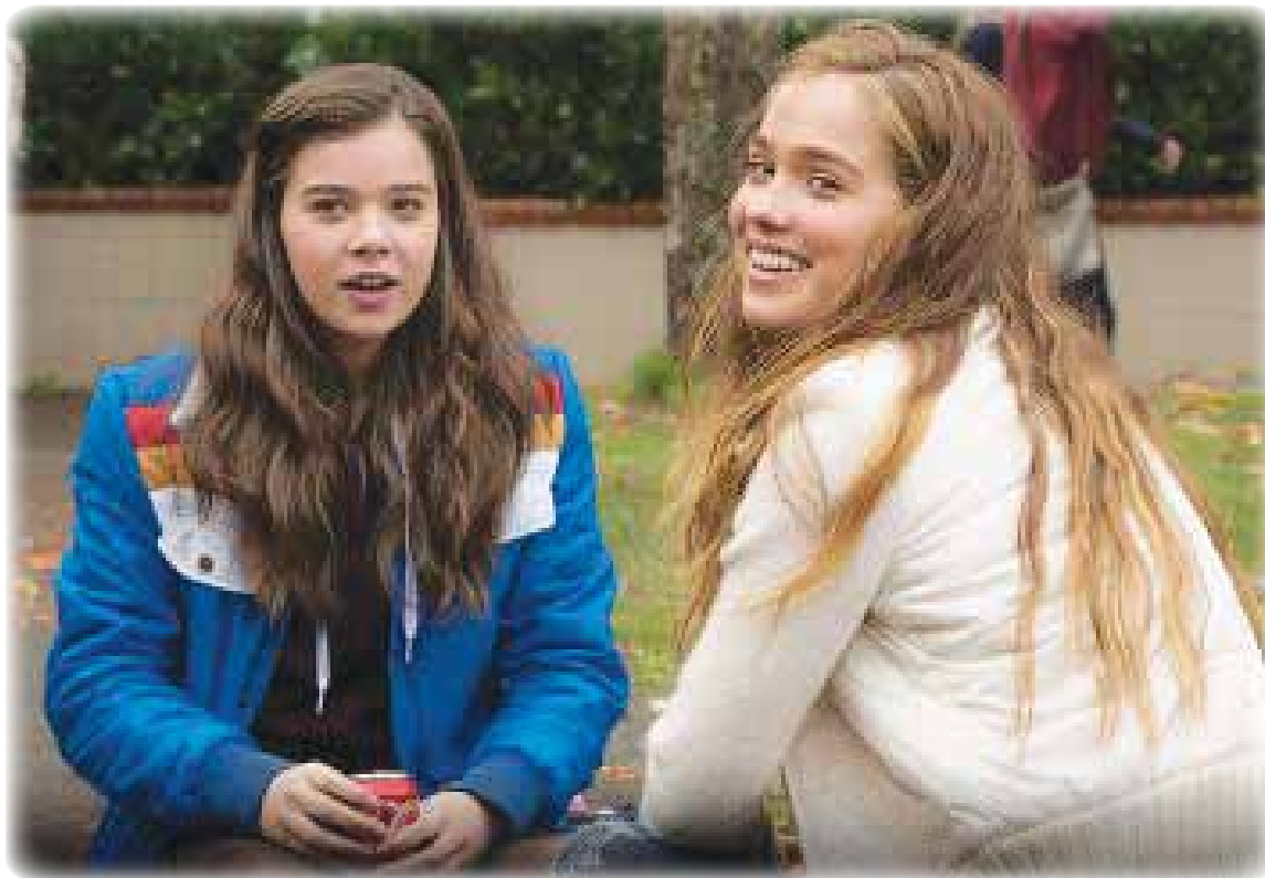
Hailee Steinfeld (L), is Nadine and Haley Lu Richardson is her BFF, Krista

Her junior year in high school has become another