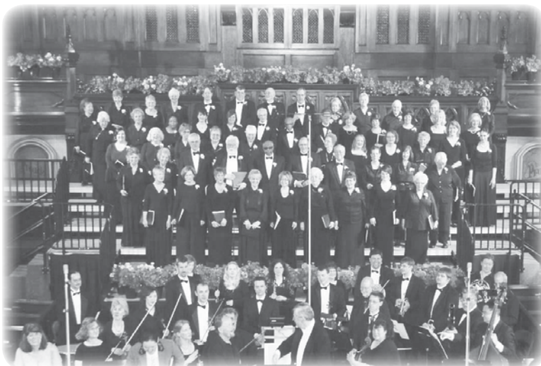
The Fort Street Chorale Performs 'Messiah'