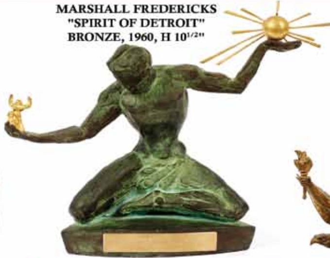
MARSHALL FREDERICKS "SPIRIT OF DETROIT" BRONZE, 1960, H 10 1/2"