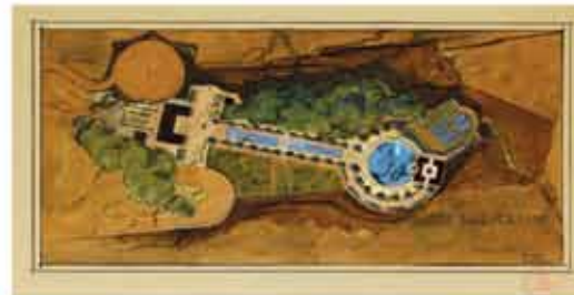
FRANK LLOYD WRIGHT WATERCOLOR & GOUACHE, 1933 "A PRIVATE MAUSOLEUM"