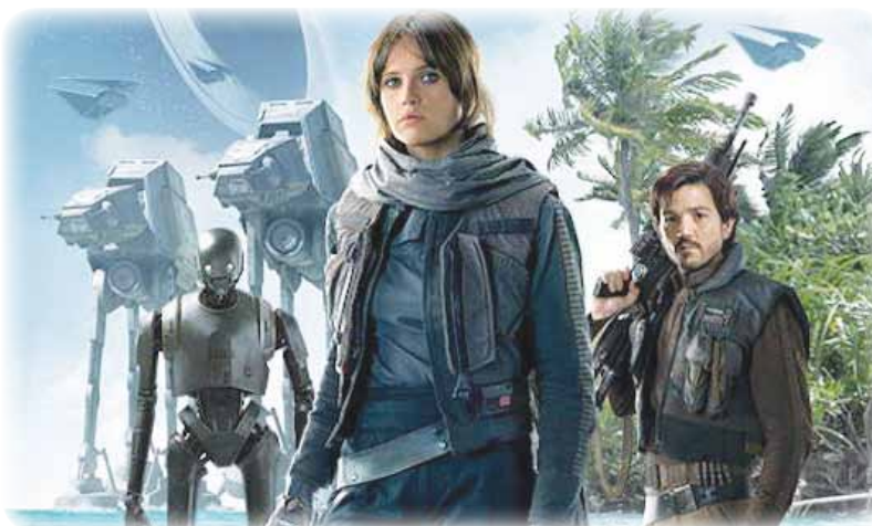
L to R: Sassy Droid, Felicity Jones, Diego Luna

The script, written by Chris Weitz and Tony Gilroy, is a basic rehash of the entirety of the Star Wars story — an inter-planetary Perils of Pauline , where our heroine, Jyn, and her patchwork group of followers, including rebel Captain Cassian Andor