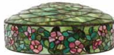
HANDEL LEADED GLASS SHADE , DIA 20.5"