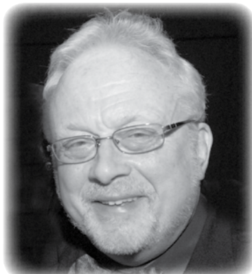
Pianist William Bolcom