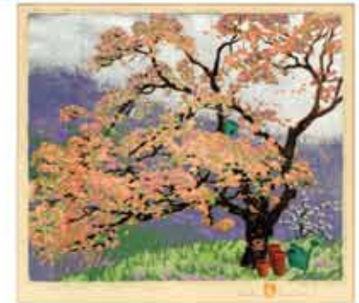
GUSTAVE BAUMANN COLOR WOODCUTS 4 LOTS