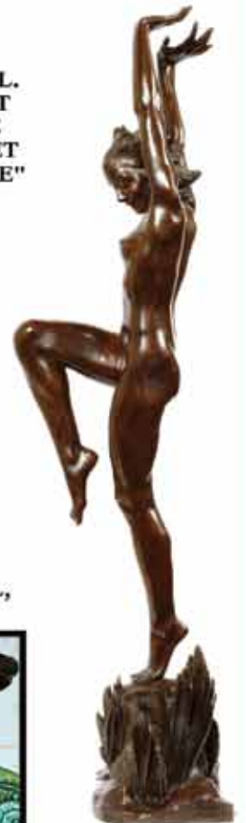
HARRIET FRISHMUTH BRONZE FOUNTAIN, 1920, H 43" "JOY OF THE WATERS"