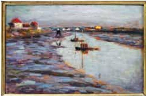
HENRI LE SIDANER OIL ON BEVELED WOOD PANEL "LA RIVIERE" 6" X 8"