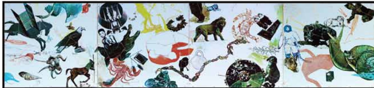
ROBERT RAUSCHENBERG , SERIGRAPH ON MIRROR-COATED PLEXIGLAS, "STAR QUARTERS", 4 PANELS, EACH PANEL: H 48", W 48"