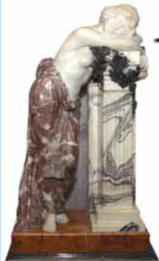
RAFFAELLO ROMANELLI MARBLE FIGURE, H 35"