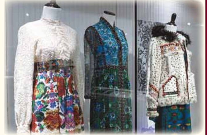
Anna Sui Exhibit for Fashion D.Fined

For more information call (313) 833-1805 or see detroithistorical.org .