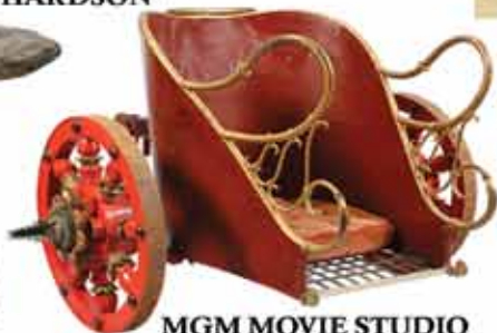
MGM MOVIE STUDIO PROPS , 12 LOTS FROM "BEN HUR" & "WIZARD OF OZ"