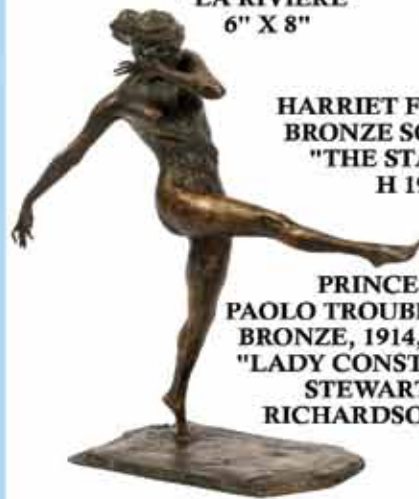
HARRIET FRISHMUTH BRONZE SCULPTURE "THE STAR", 1918 H 19 1/2"